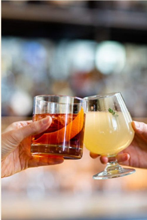
Captions can be added: if needed